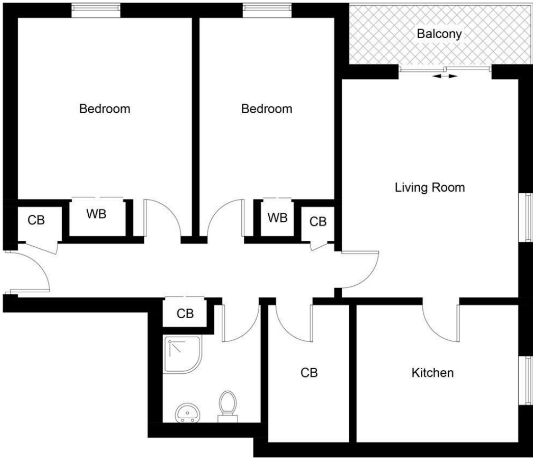
Illustration for identification purposes only, measurements are approximate, not to scale. Fourlabs.co © (ID1187237)